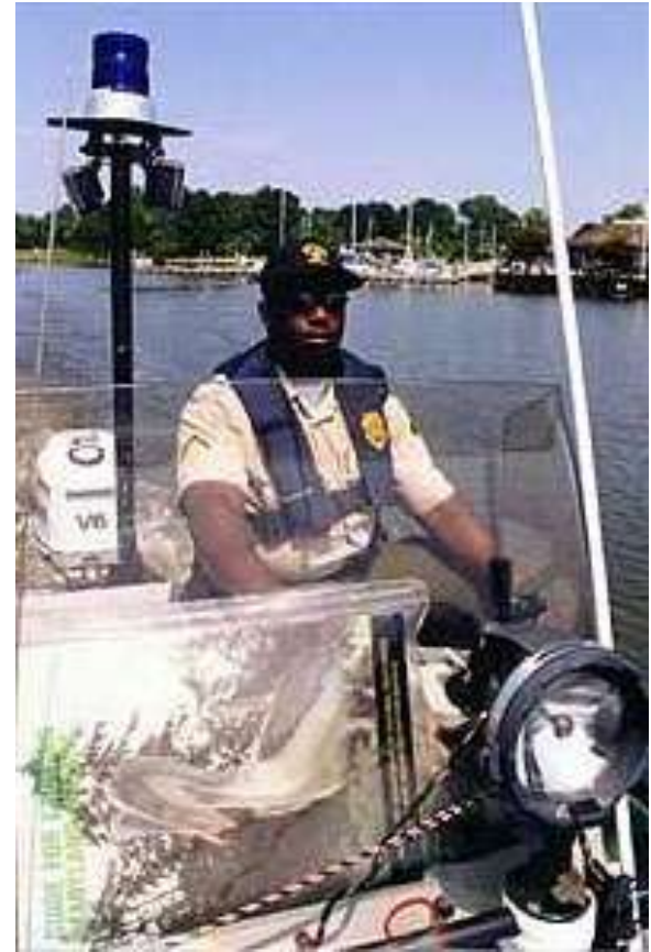
MD Natural Resources